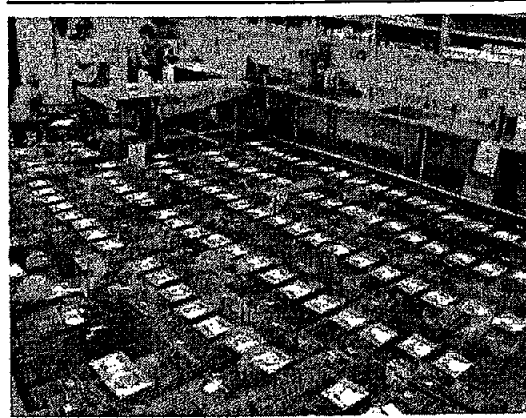
Figure 23.2. Some large-scale clinics specializing in feral cat surgery are capable of sterilizing more than 150 cats in a single day.

One of the dominant concerns about working with feral cats is safety. Feral cats have an uncanny abil-