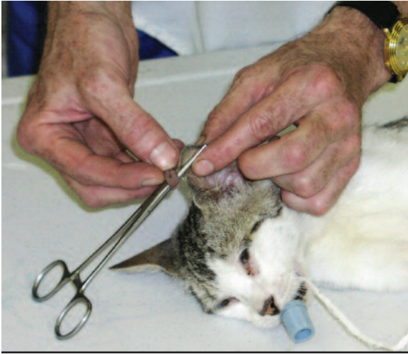
▲ Ear tipping (surgically removing the tip of a feral cat's ear) is an essential method of marking a sterilized feral cat so that it can be identified in the future.

If transferring an awake feral cat to different housing is unavoidable, it should always be done in a closed room with a solid ceiling because cats can rapidly go through a suspended-tile ceiling. Although some staff members are adept at using gloves, towels, or thick blankets to catch fractious cats, this technique should not be used to restrain a feral cat because it is not only unsafe for staff but also very stressful for the cat. A more appropriate way to catch a feral cat is with a special net that staff members have been trained to use correctly. The net should have small mesh and should be closable once the cat is either in or under it. If the cat escapes to an inaccessible place, tuna in oil, sardines in oil, or mackerel should be placed in a humane trap, with water available outside the trap.